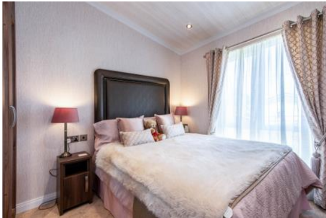
Bedroom One 3.66m x 2.97m (12'0" x 9'8")