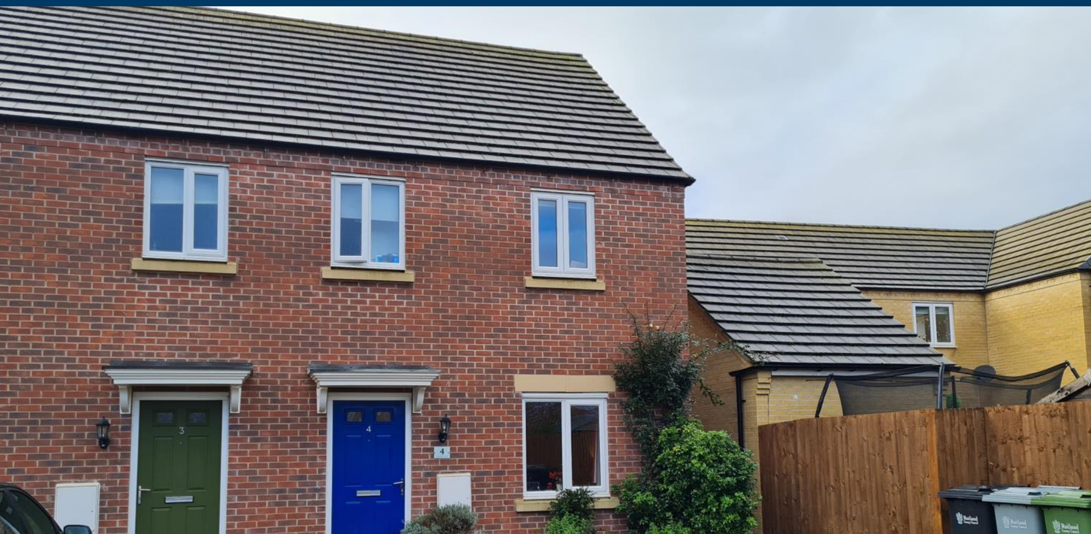
Blackberry Close, Barleythorpe