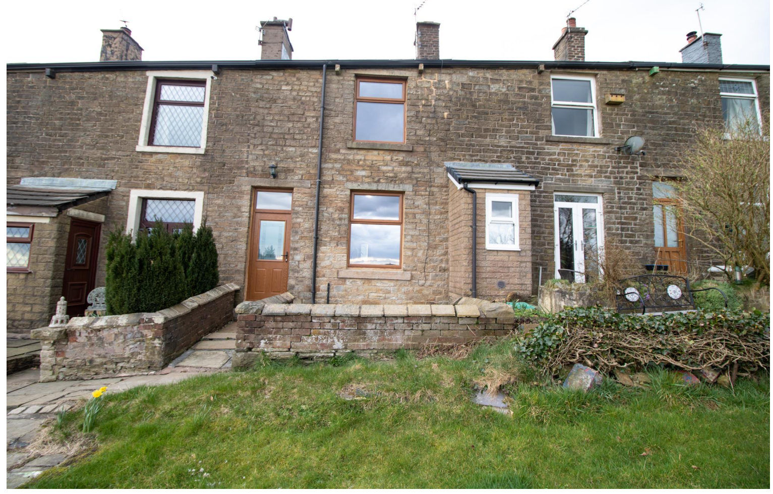
Prospect Terrace, Belthorn, Darwen, Blackburn, BB1 2NS