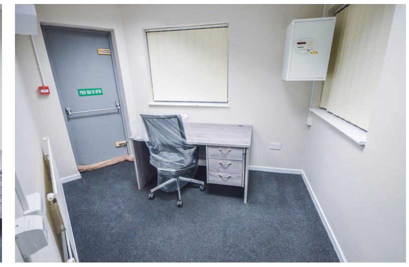
Downs Business Park, Altrincham, WA14 Asking Price £700pcm