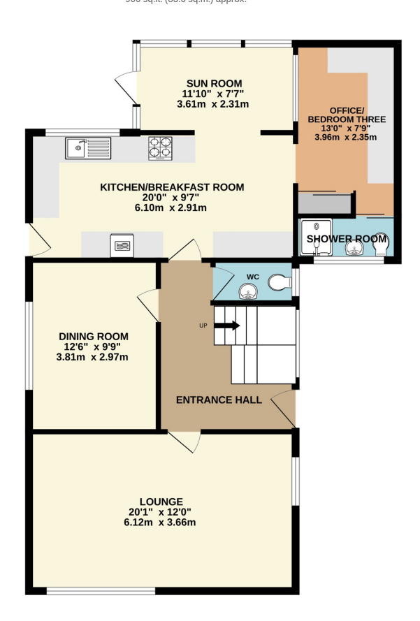
1ST FLOOR 694 sq.ft. (64.5 sq.m.) approx.