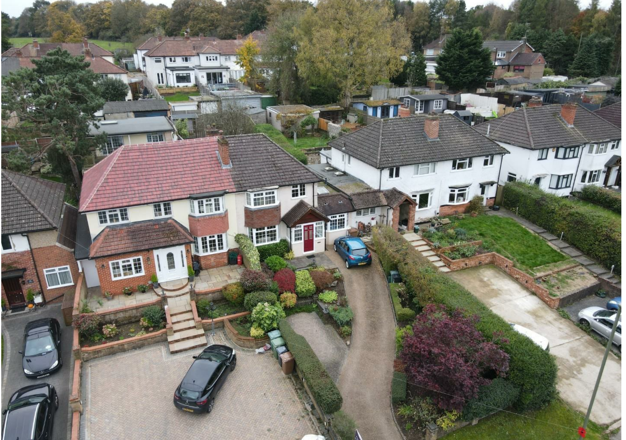
Chipstead Lane, Tadworth