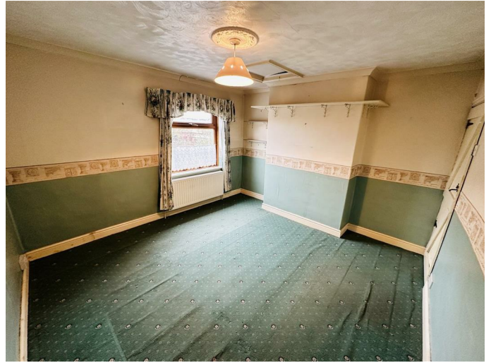
UPVC double glazed window to front elevation, central heating radiator and loft access.