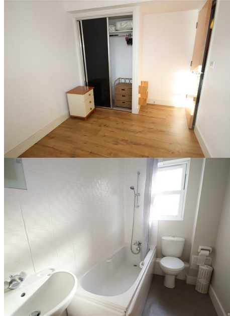
New Street Cambridge

Sales Office: 169 Mill Road, Cambridge CB1 3AN 01223 246262 sales@bushandco.co.uk