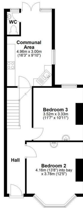
Ground Floor Approx. 51.3 sq. metres (552.3 sq. feet)