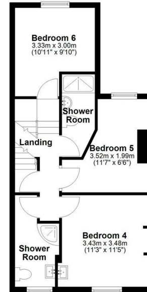
First Floor Approx. 46.1 sq. metres (496.4 sq. feet)