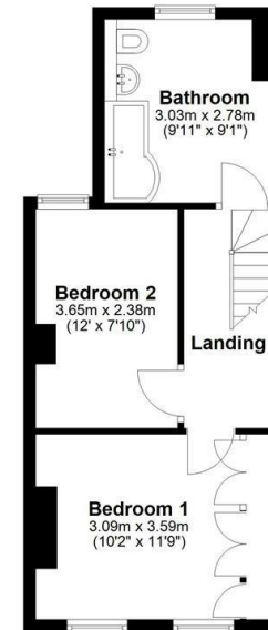
First Floor Approx. 36.4 sq. metres (391.5 sq. feet)