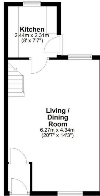
Ground Floor Approx. 33.1 sq. metres (356.1 sq. feet)