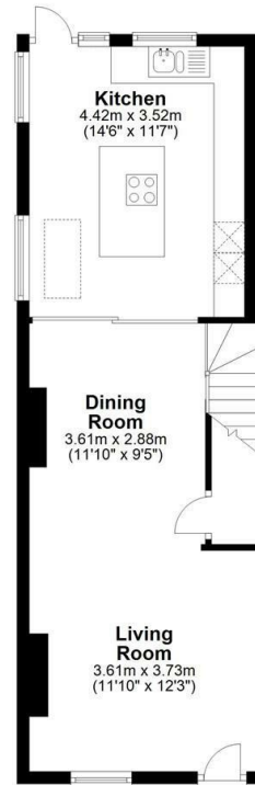
First Floor Approx. 35.0 sq. metres (376.7 sq. feet)