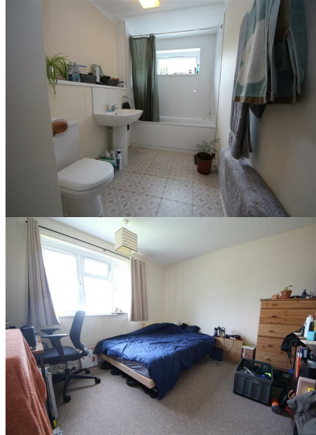
Musgrave Way, Fen Ditton, CB5 8TD

located four miles north east of the city of Cambridge within cycling distance of Cambridge North station. The village offers riverside walks and a number of inns and a primary school. The location allows access to the A14, M11, A10, Cambridge Science Park and Newmarket Road leading to the city centre.