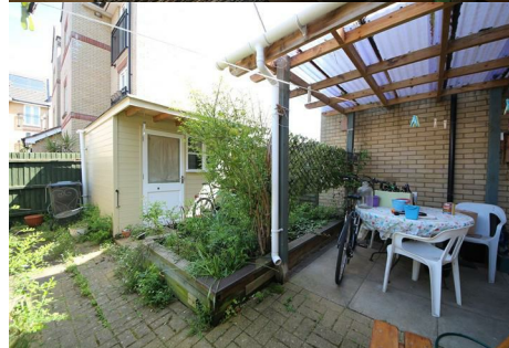
Grebe Court, Cambridge, CB5 8FR