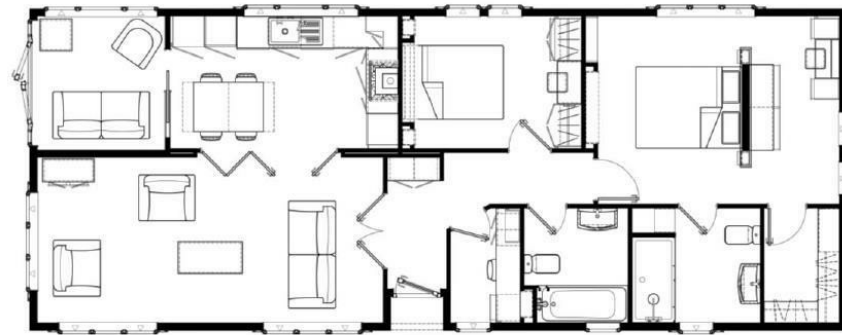
Anniversary 50' x 22' 2DB