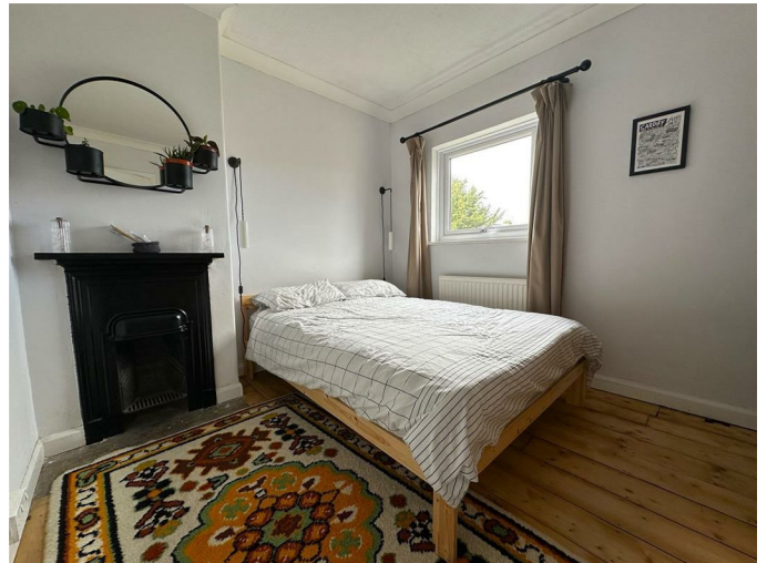
Bedroom Two 10'09" x 8'10" (3.28m x 2.69m)

Double glazed window to the rear, radiator, stripped floorboards and cast iron fireplace.