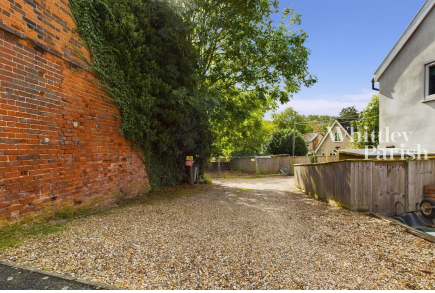
*DEVELOPMENT OPPORTUNITY* An excellent opportunity to acquire a single building plot with full planning permission granted for the erection of a two bedroom single storey detached dwelling.