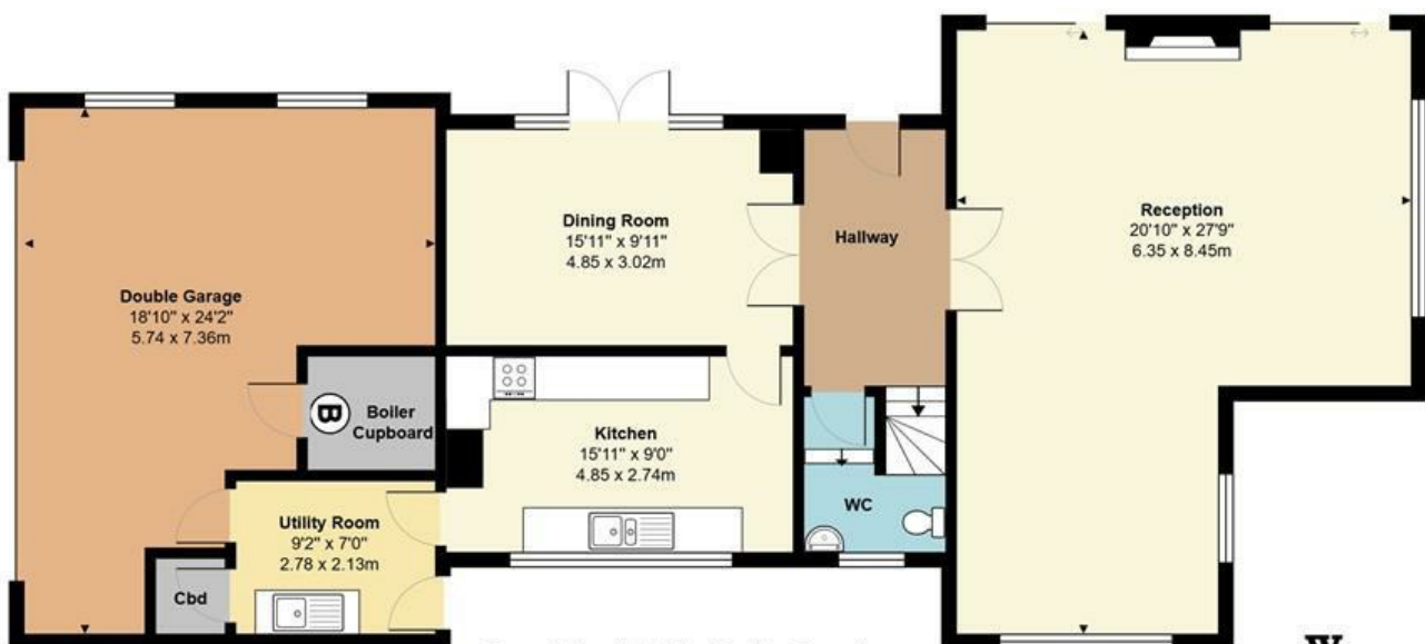
Ground Floor (Including Double Garage) Area: 1396 ft² ... 129.7 m²

Total Area: 2555 ft² ... 237.3 m² (Including Double Garage) All measurements are approximate and for display purposes only