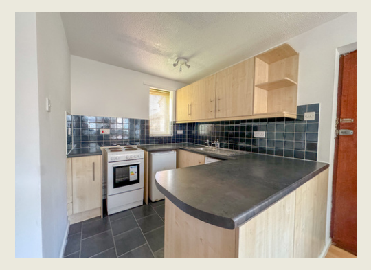
35 Weston Way Newmarket Suffolk CB8 7SB

2 Wellington Street Newmarket, Suffolk, CB8 0HT newmarket@pocock.co.uk 01638 668284