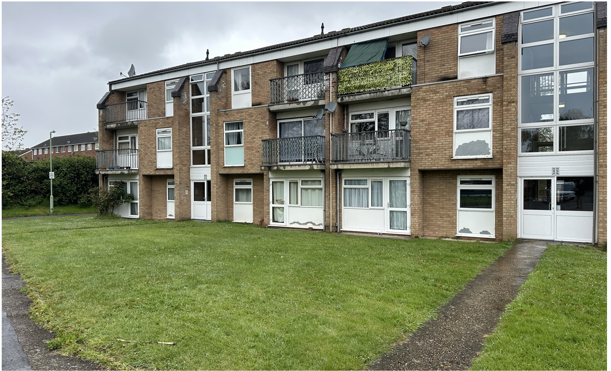
George Lambton Avenue, Newmarket, Suffolk