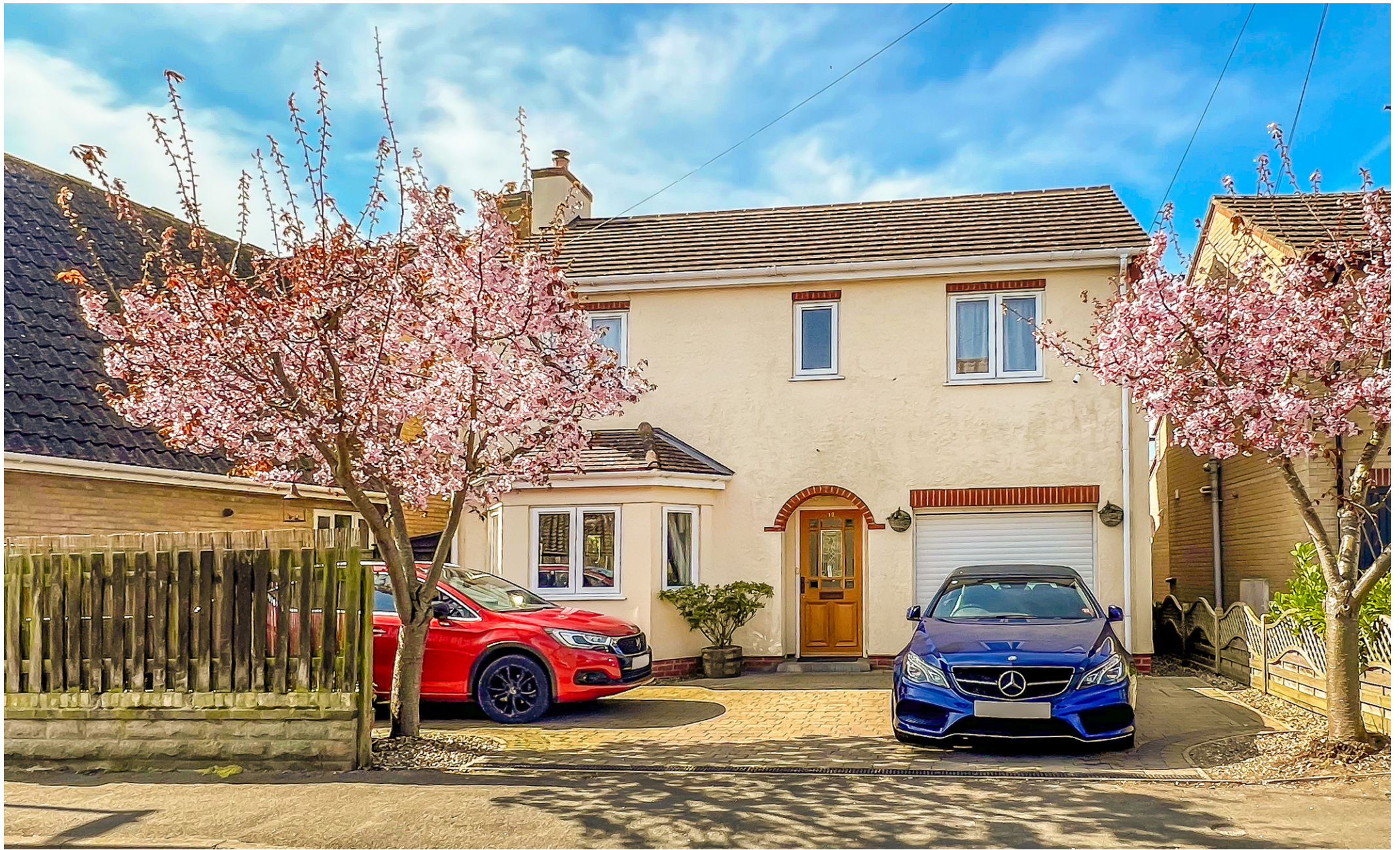
New Path, Fordham, Ely, Cambridgeshire