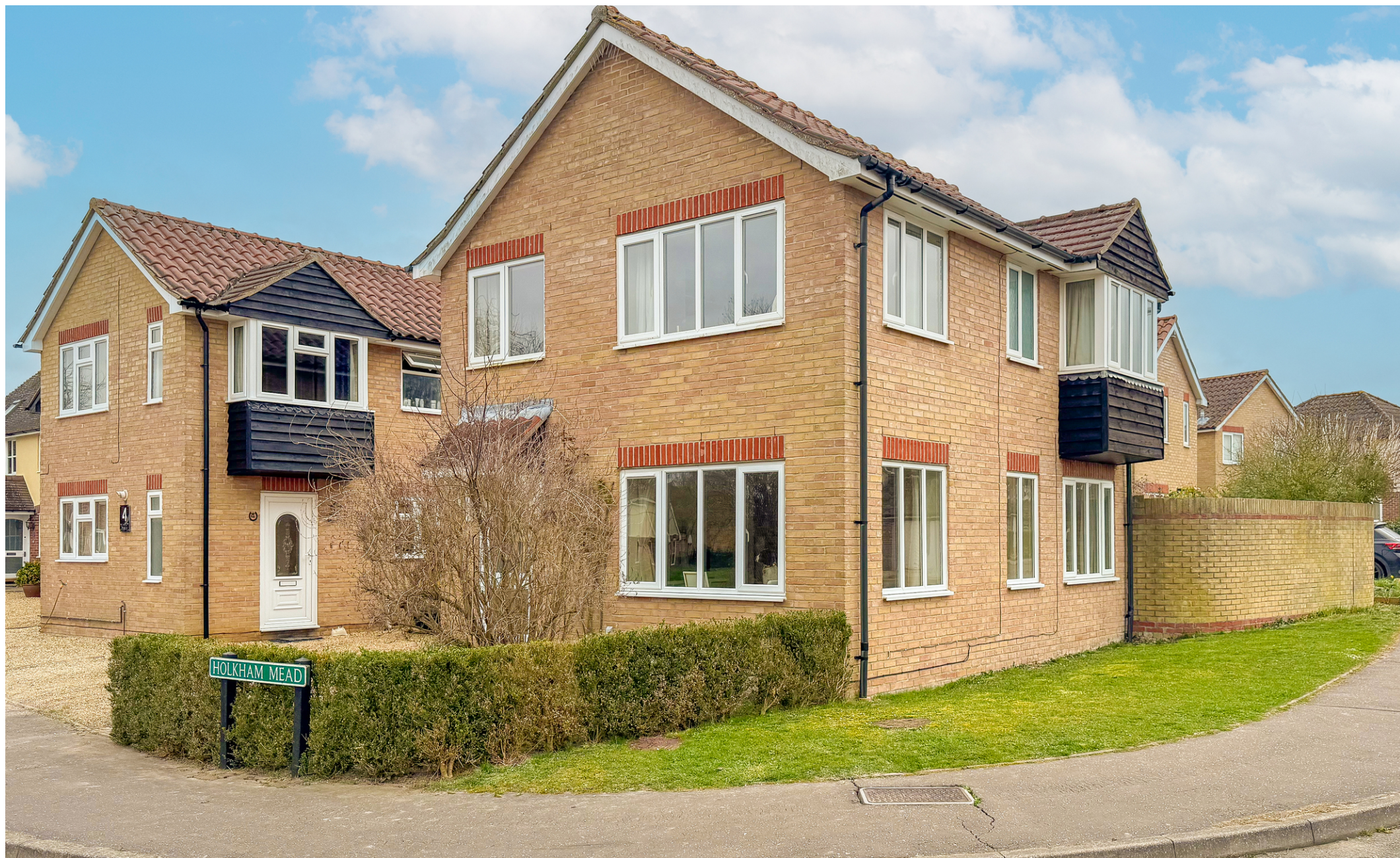
Holkham Mead, Burwell, Cambridge, Cambridgeshire