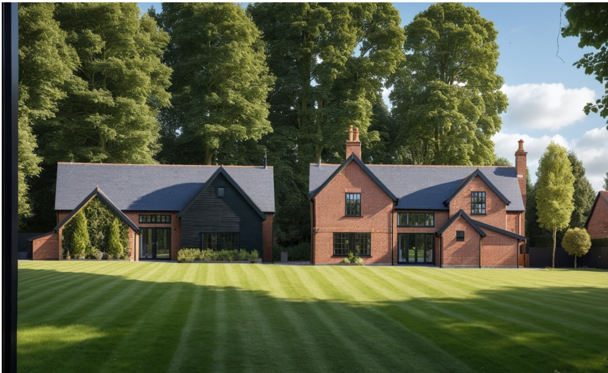
Building plot, Hargrave, Bury St. Edmunds, Suffolk