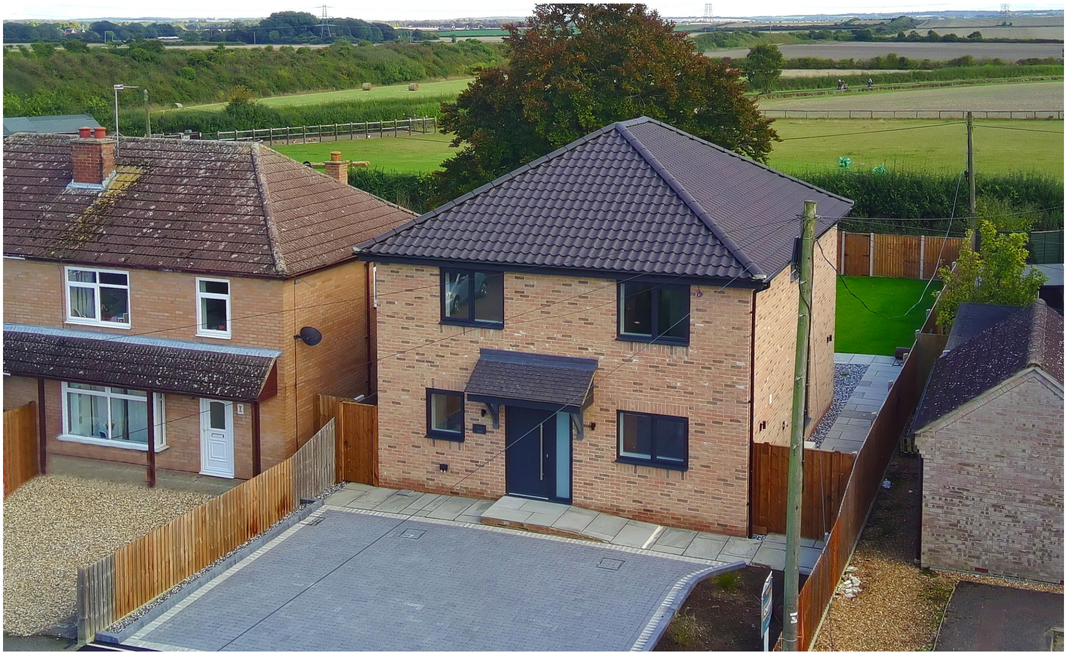
New House, Ditchfield, Reach, Cambs