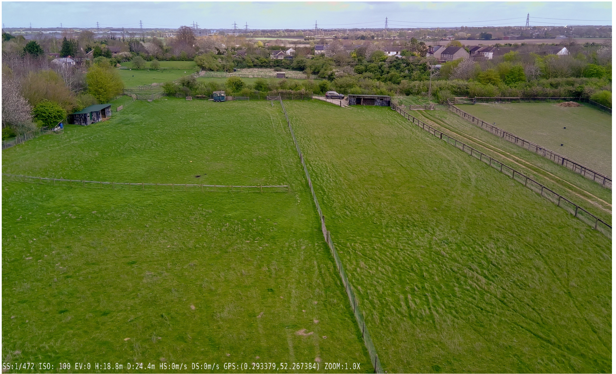
Prime Paddock & Grazing Land