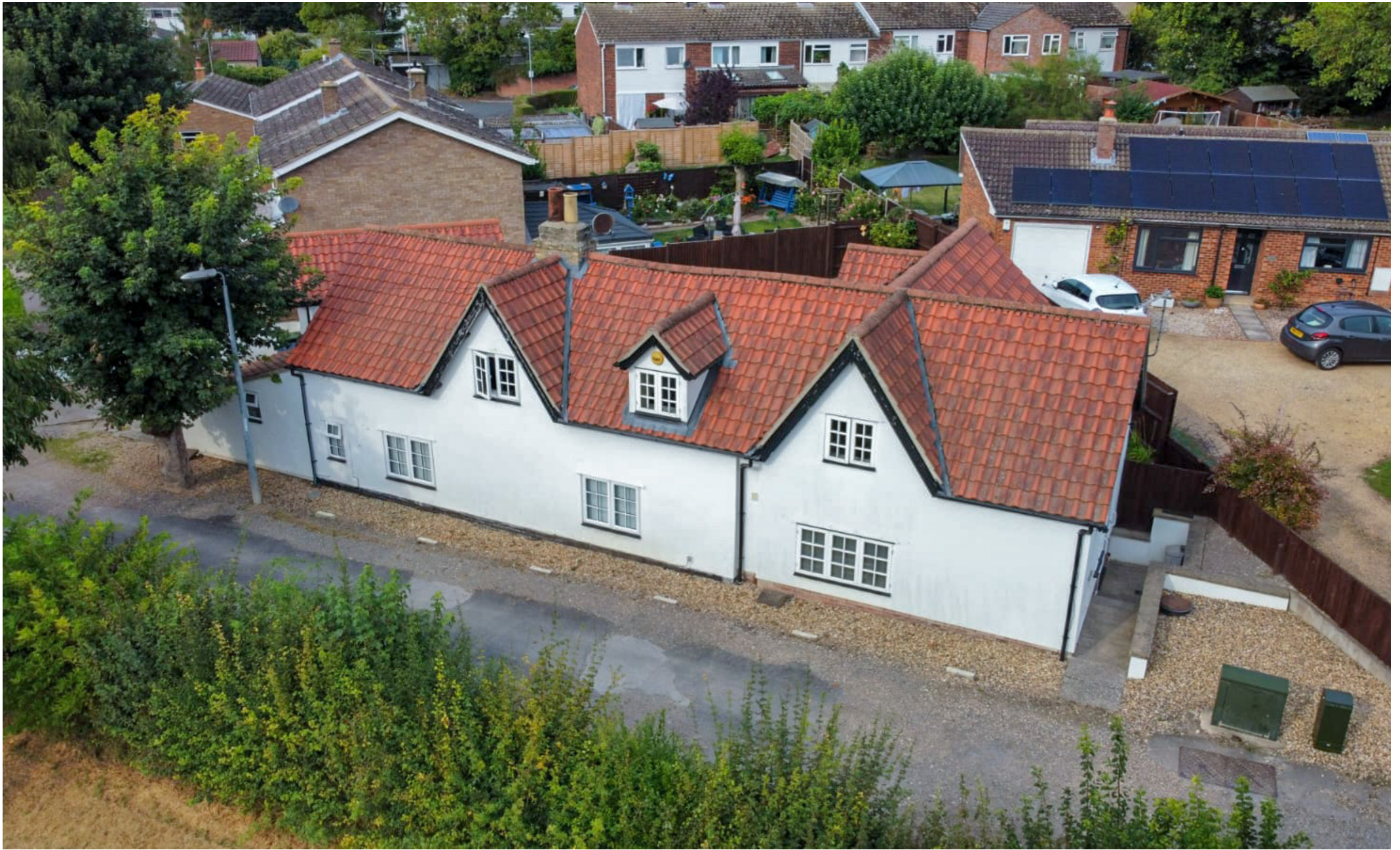
Spring Close Burwell Cambridgeshire