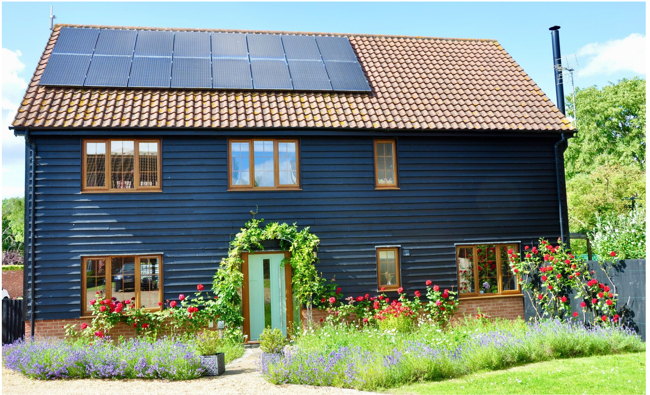
Twentypence Road, Wilburton, Ely