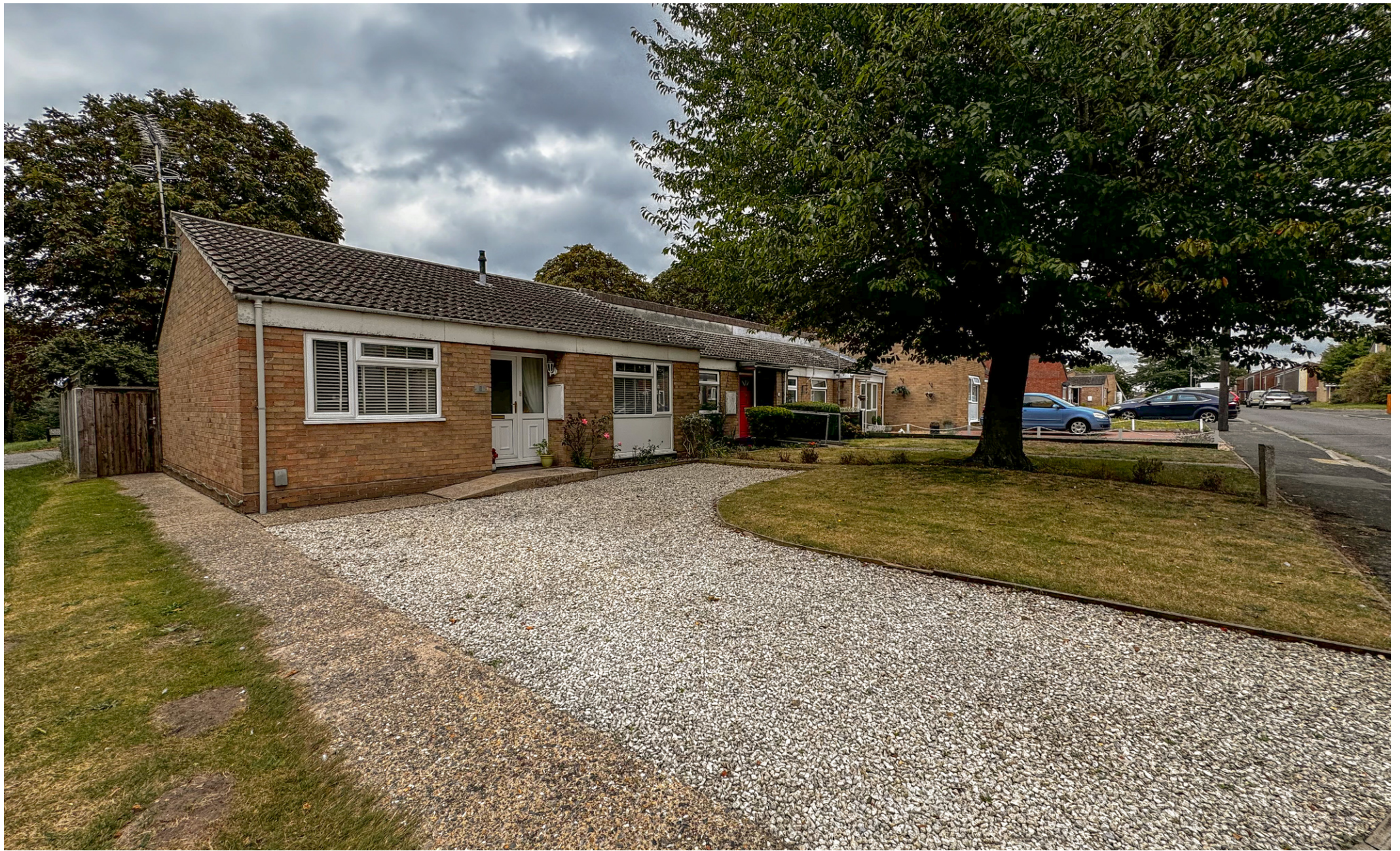
Laureate Gardens, Newmarket