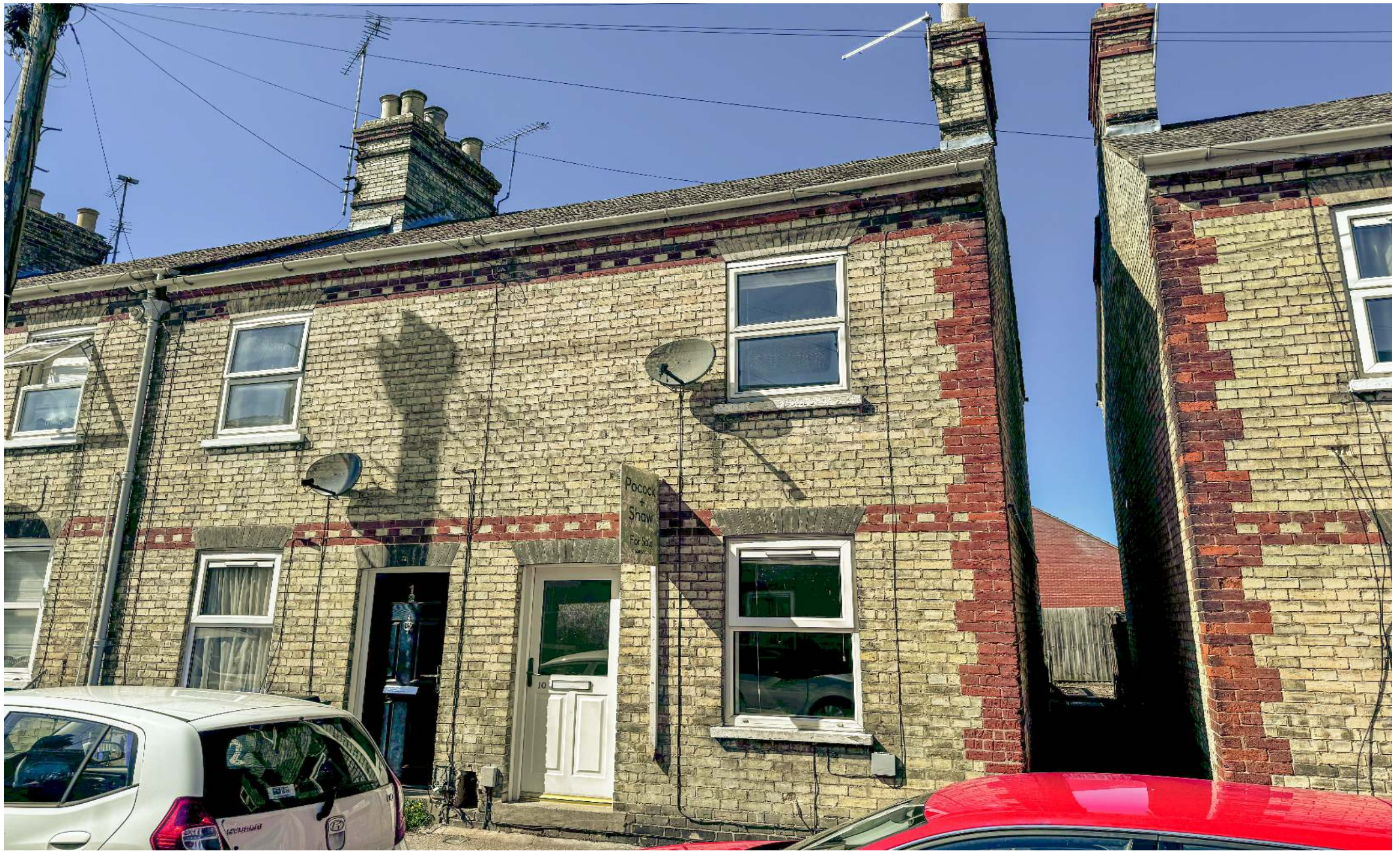
Warrington Street, Newmarket, Suffolk