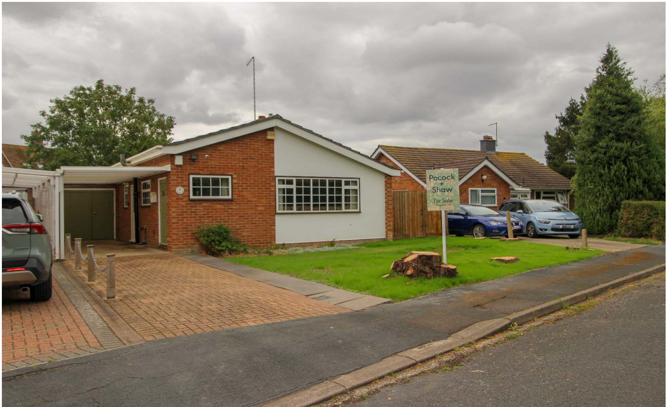
Scotred Close Burwell