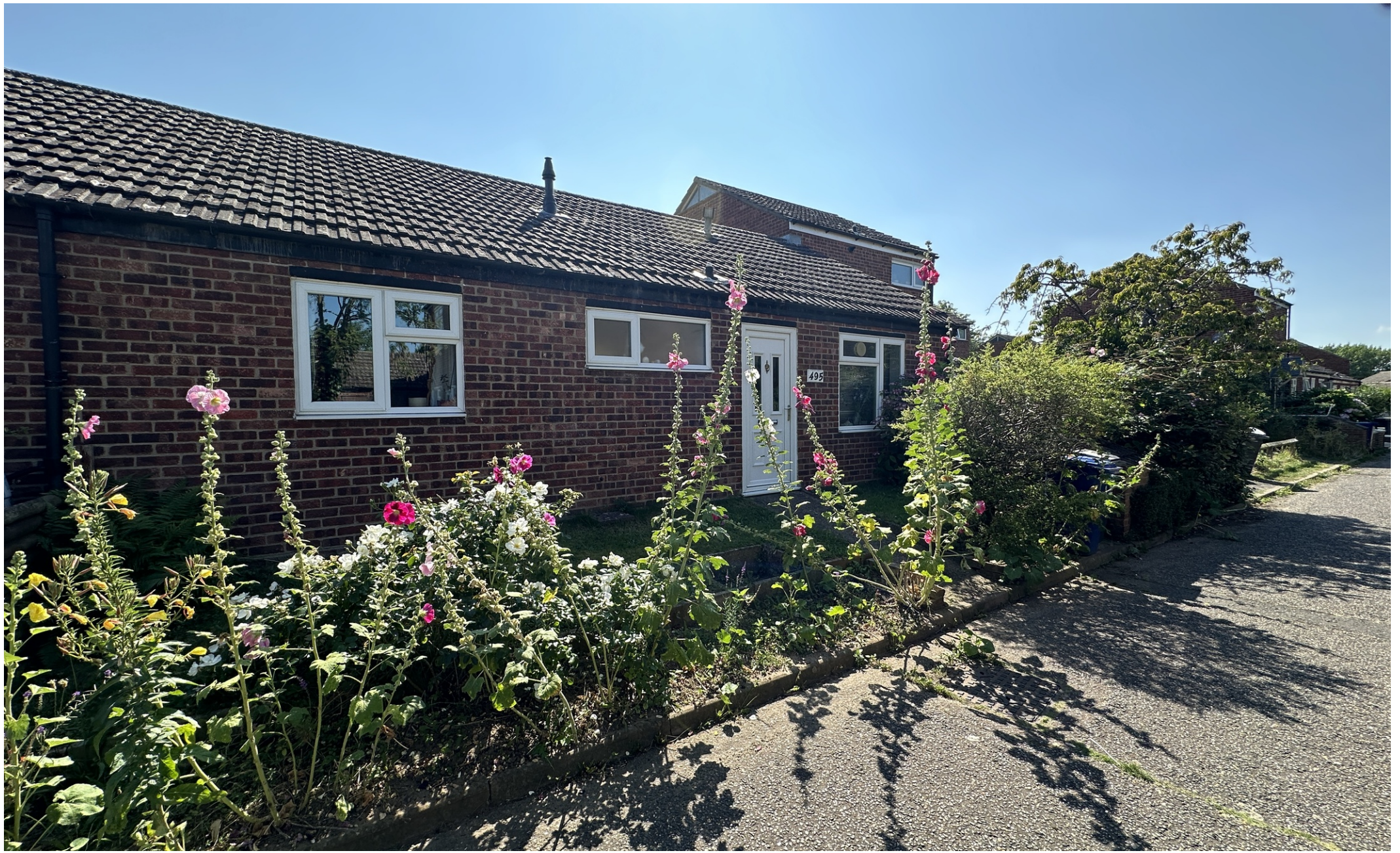
Aureole Walk, Newmarket, Suffolk