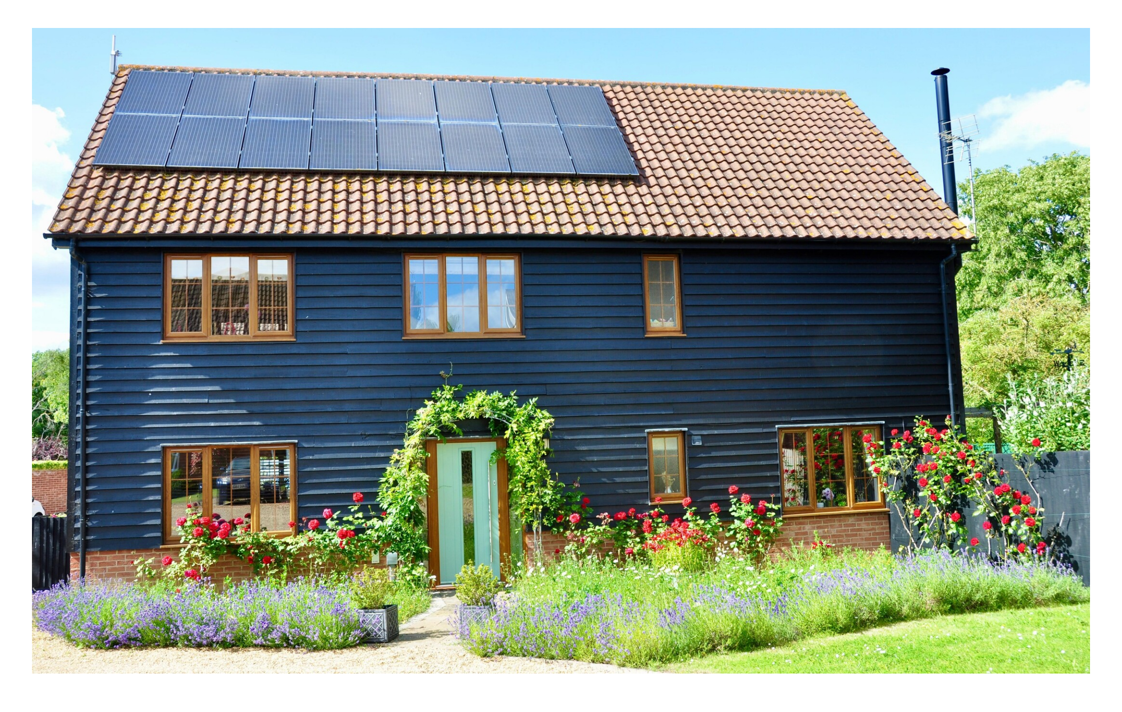
Twentypence Road, Wilburton, Ely