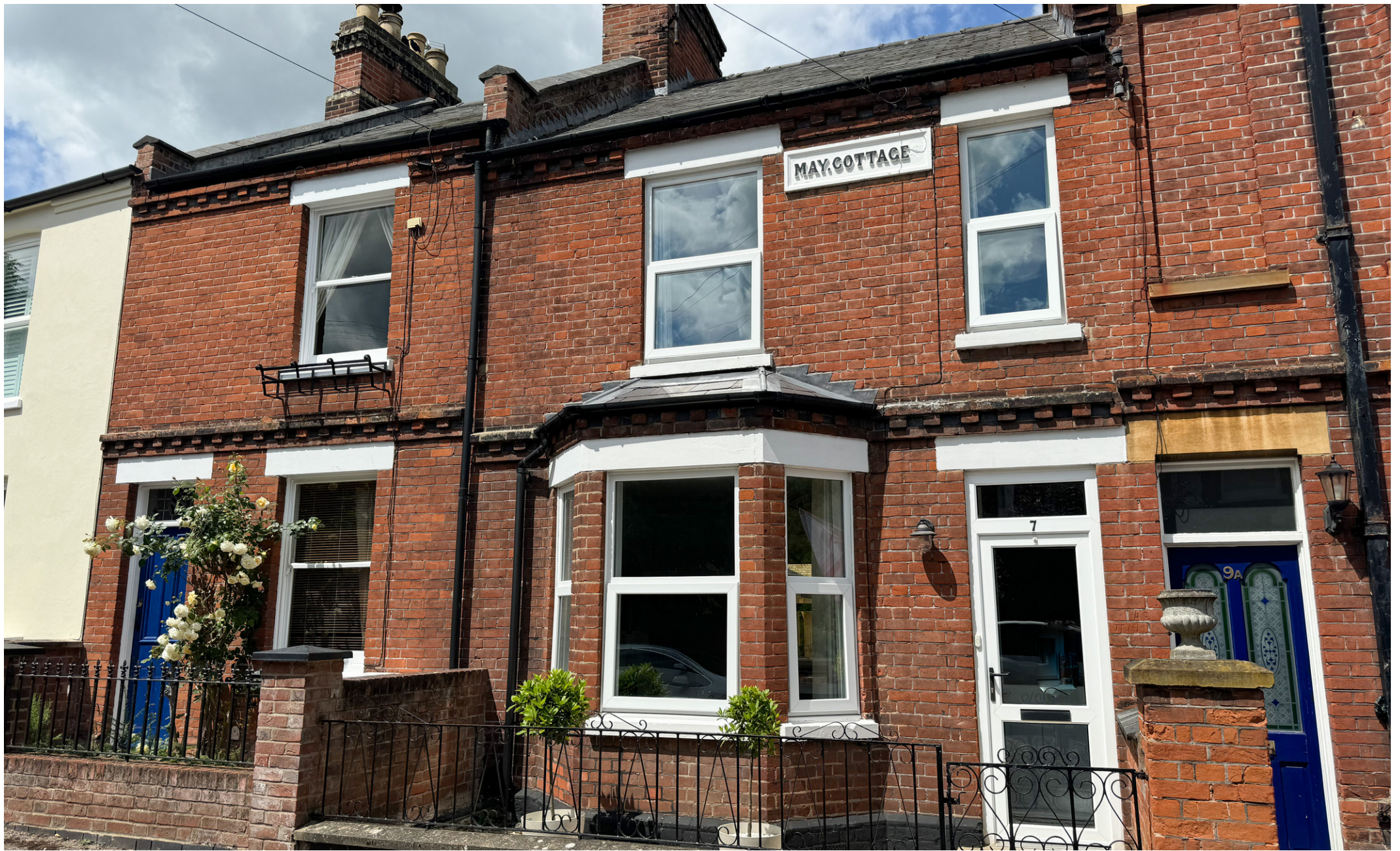
“May Cottage”, Doris Street, Newmarket, Suffolk