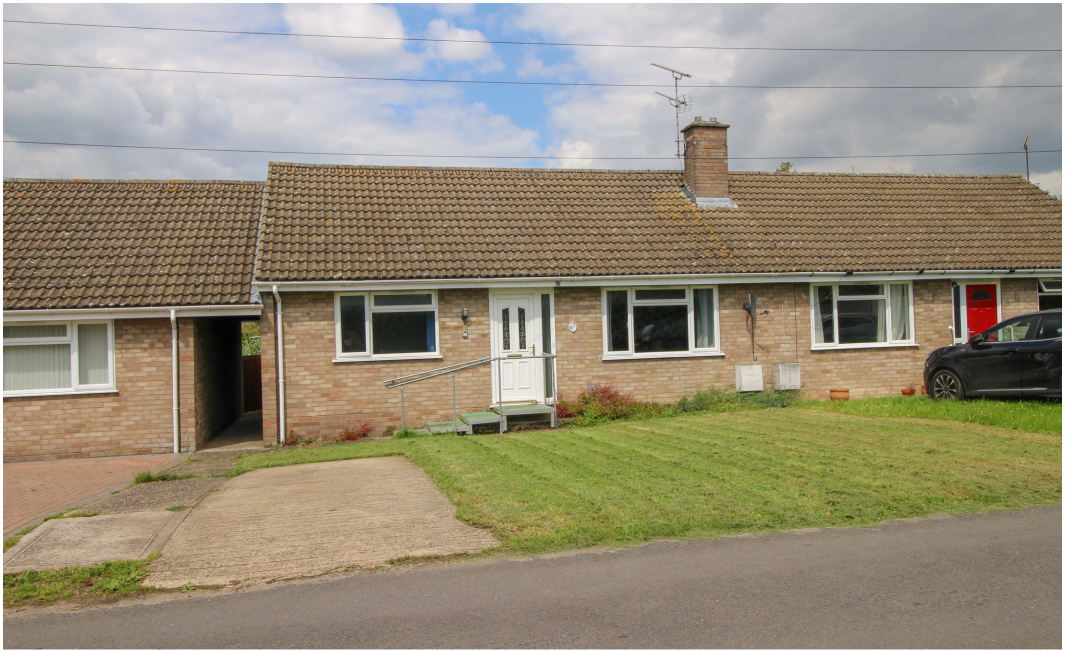
Buntings Path Burwell