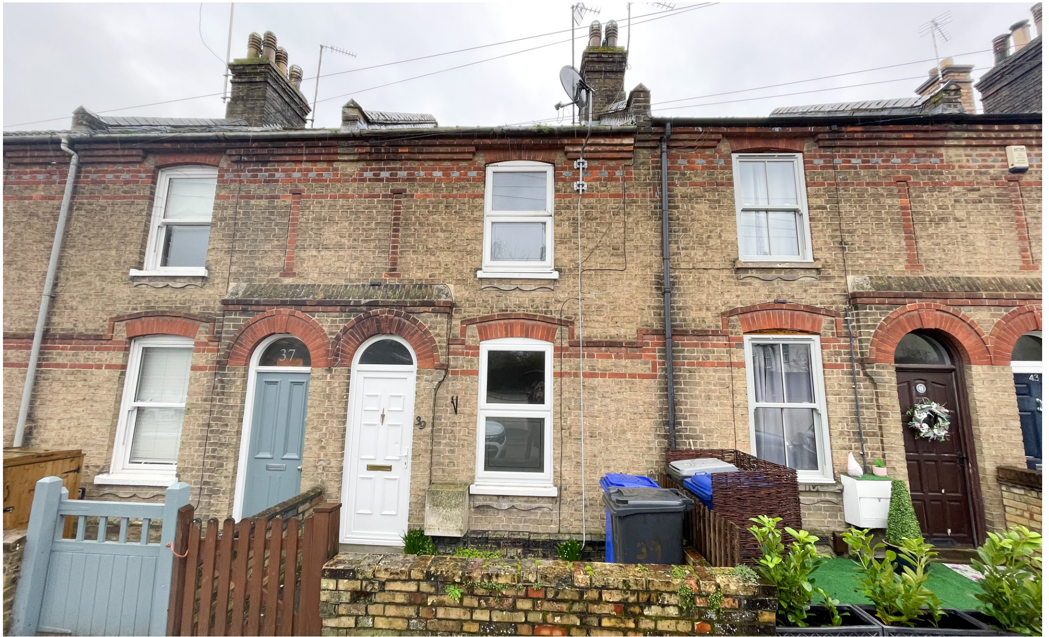
Exeter Road, Newmarket