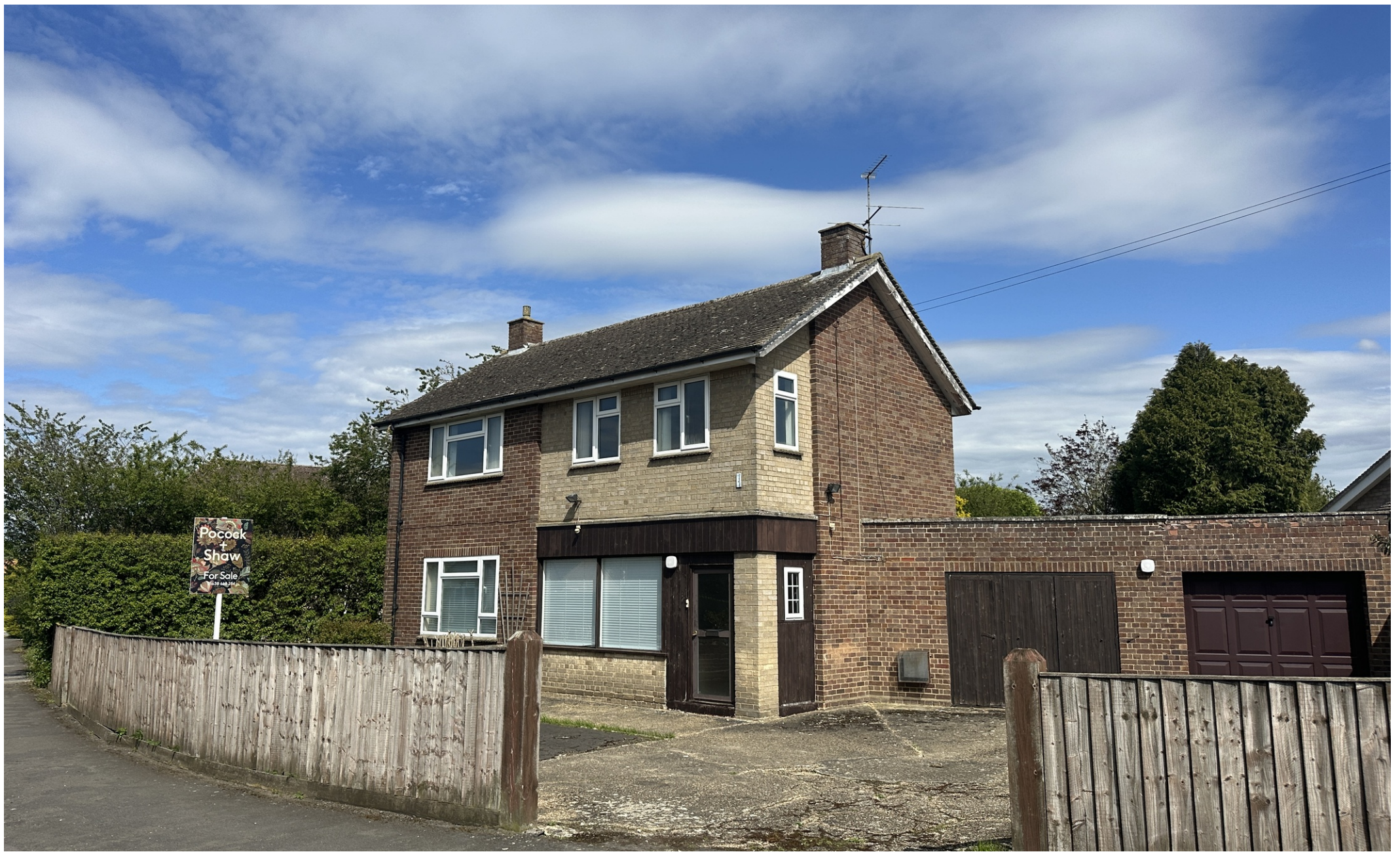
Centre Road Soham