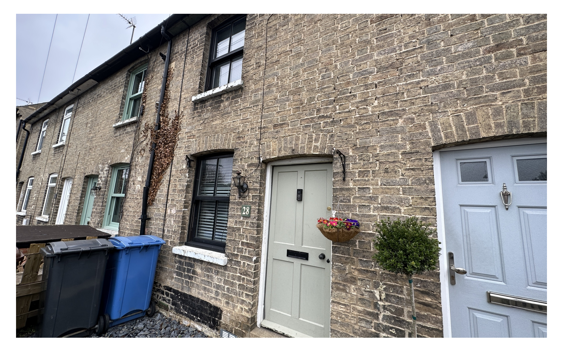
Church street Exning