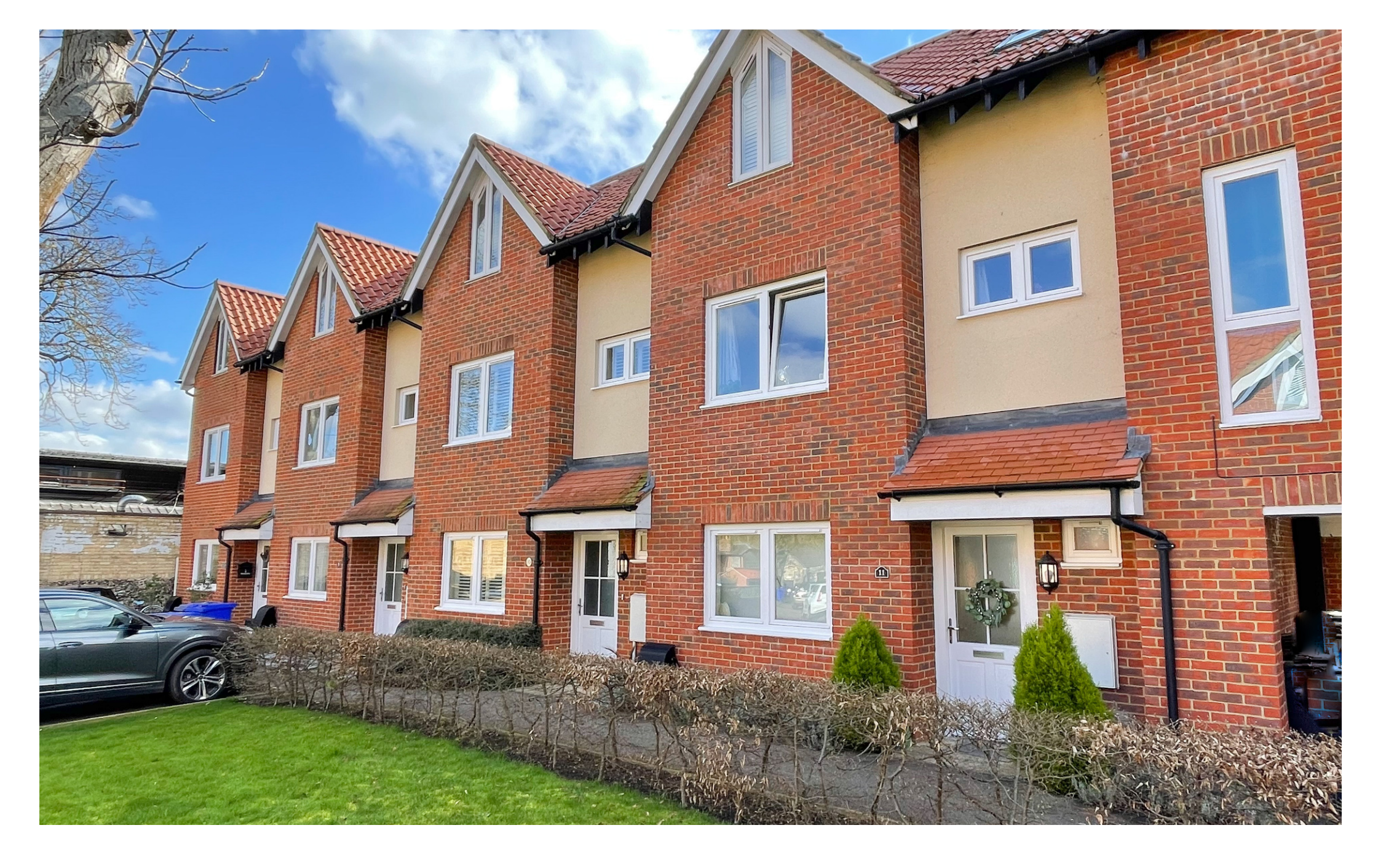
Abernant Drive, Newmarket, Suffolk