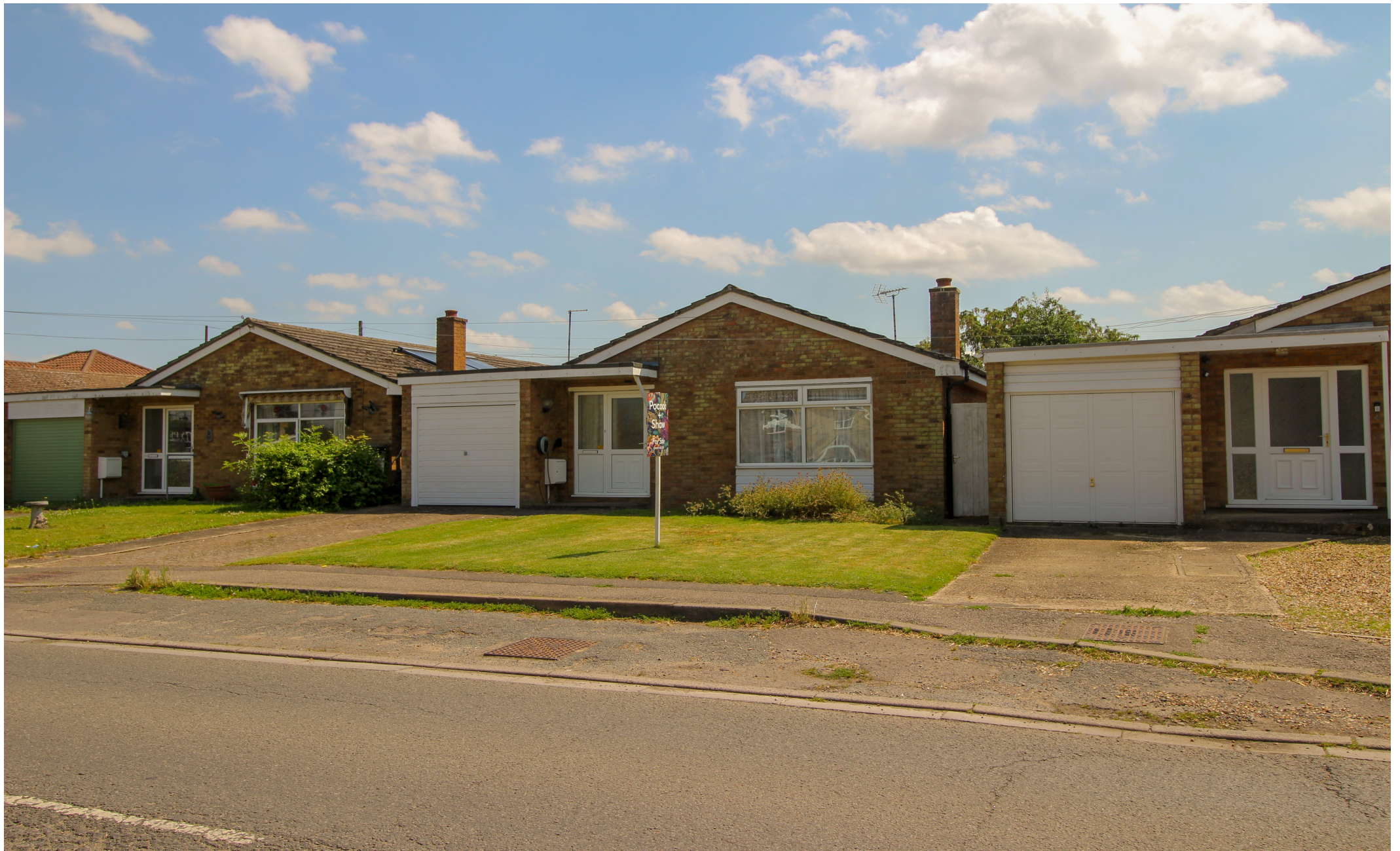
Ness Road Burwell Cambridge