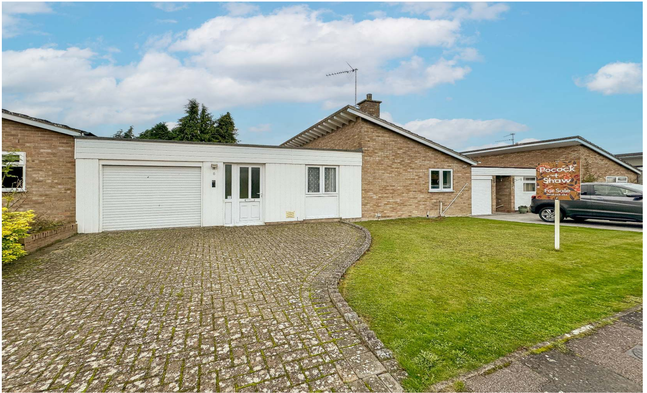
Parsonage Close, Burwell