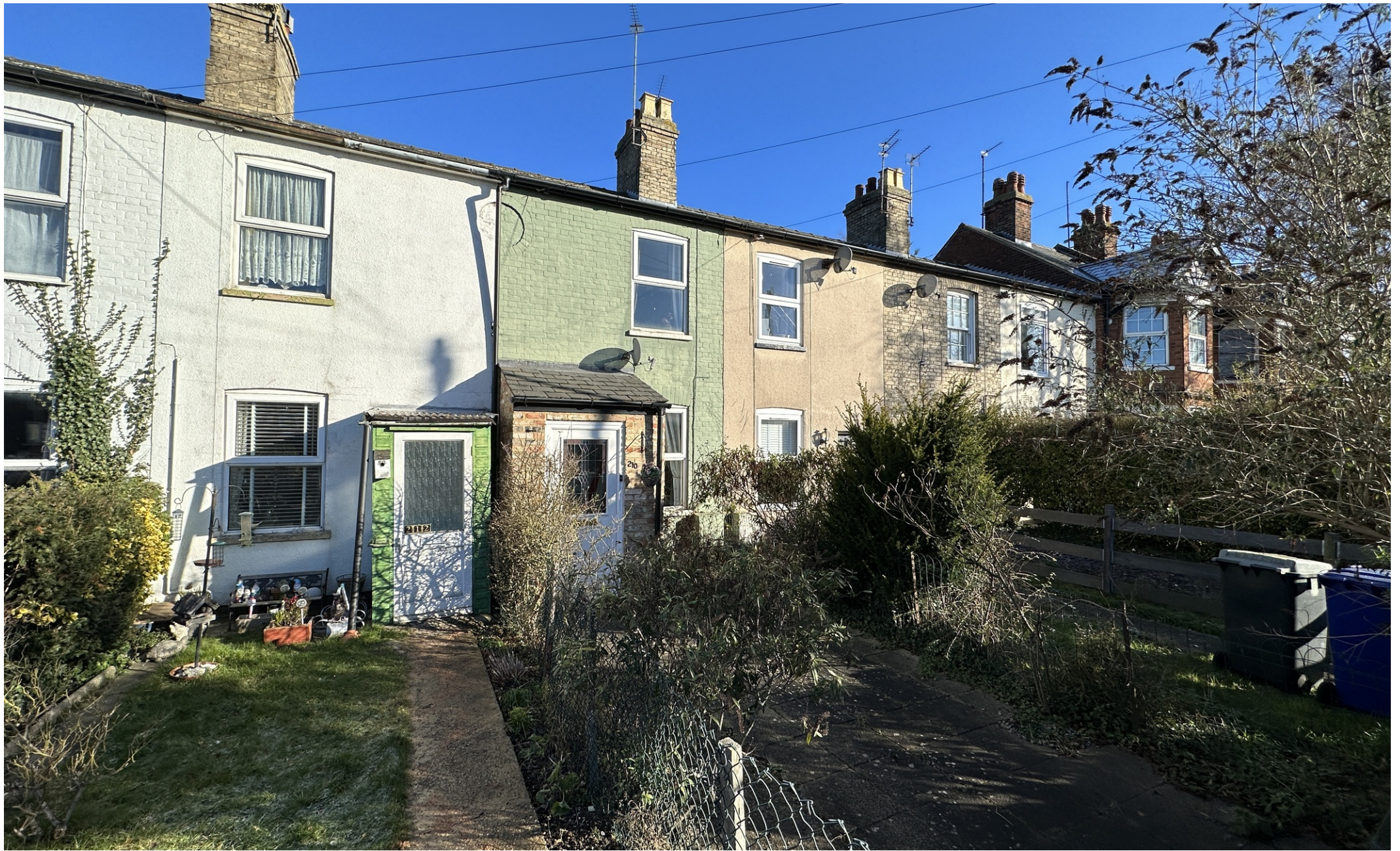
Exning Road, Newmarket