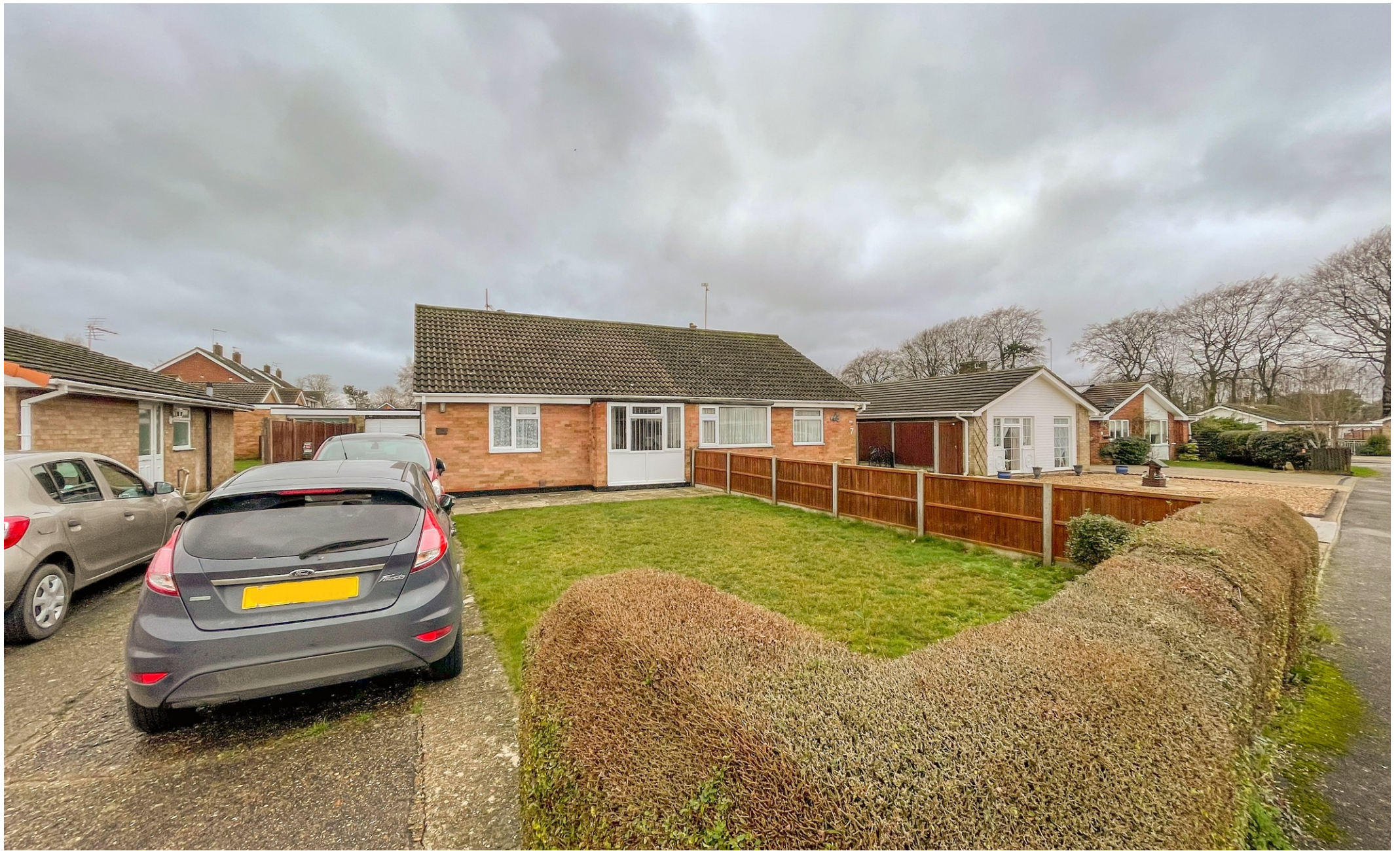
Rosebery Way, Newmarket, Suffolk