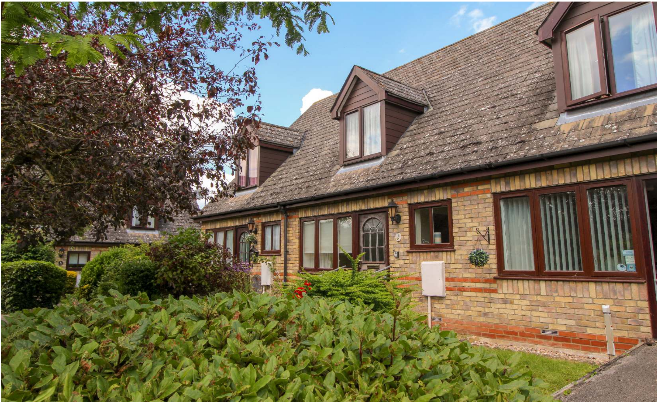
Ash Grove Burwell Cambridgeshire