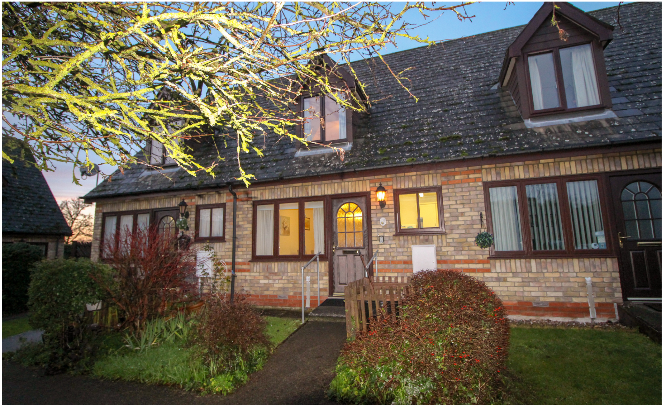
Ash Grove Burwell Cambridgeshire