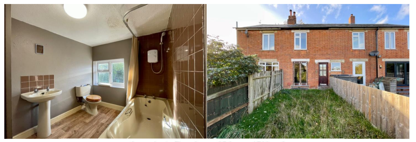
Approximate Floor Area = 65.9 sq m / 709 sq ft