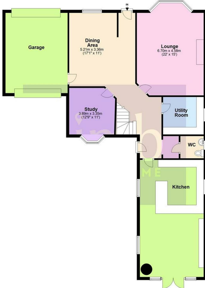
Ground Floor Approx. 143.7 sq. metres (1546.3 sq. feet)