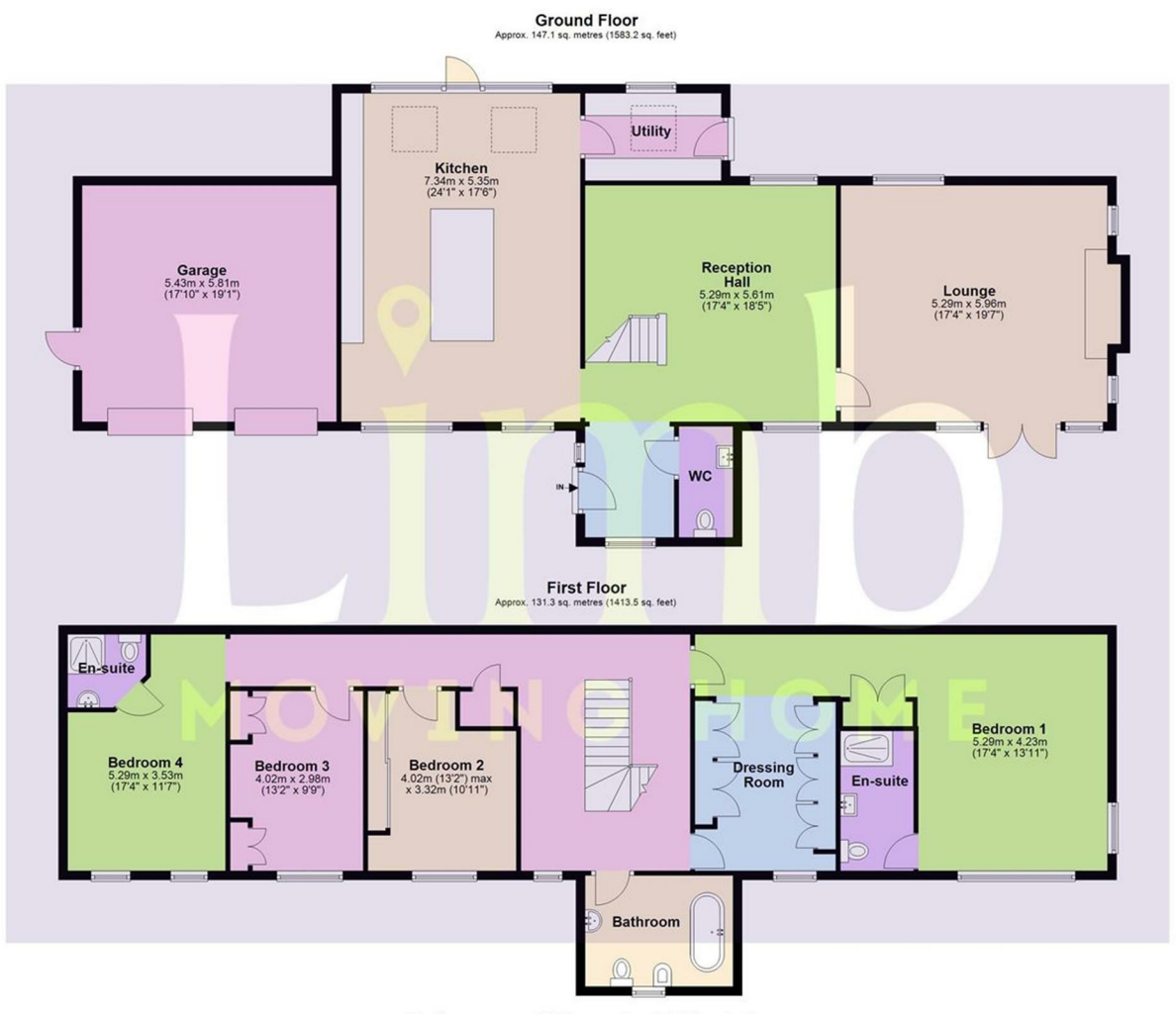
Total area: approx. 278.4 sq. metres (2996.7 sq. feet) Orchard House