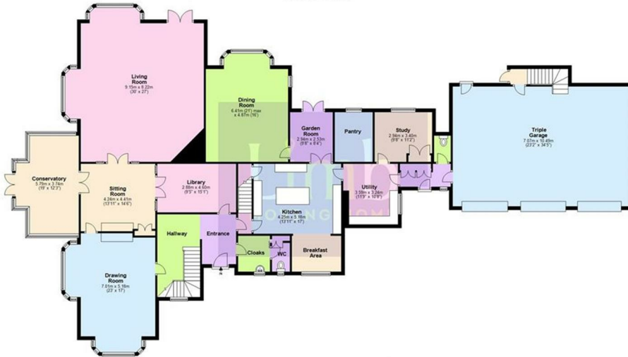
Ground Floor Approx. 363.7 sq. metres (391.4 sq. feet)