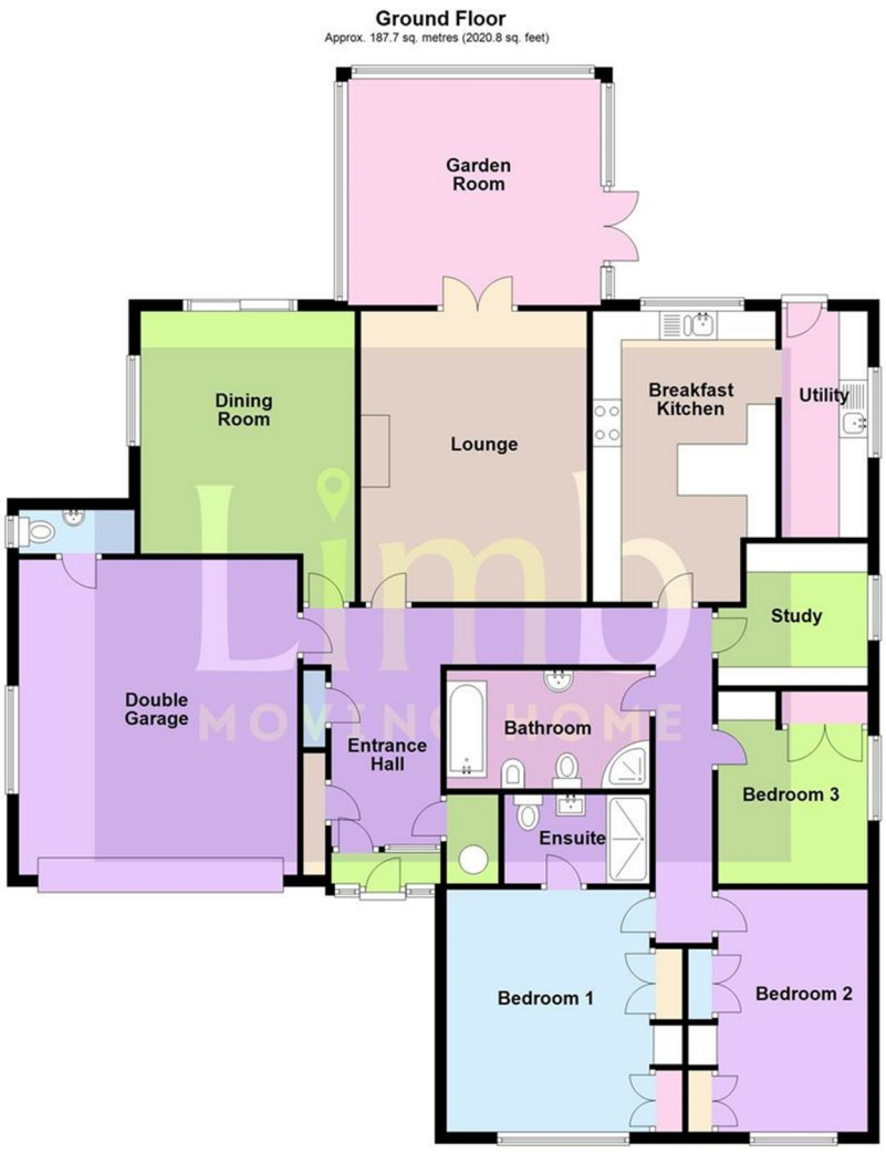
Total area: approx. 187.7 sq. metres (2020.8 sq. feet)