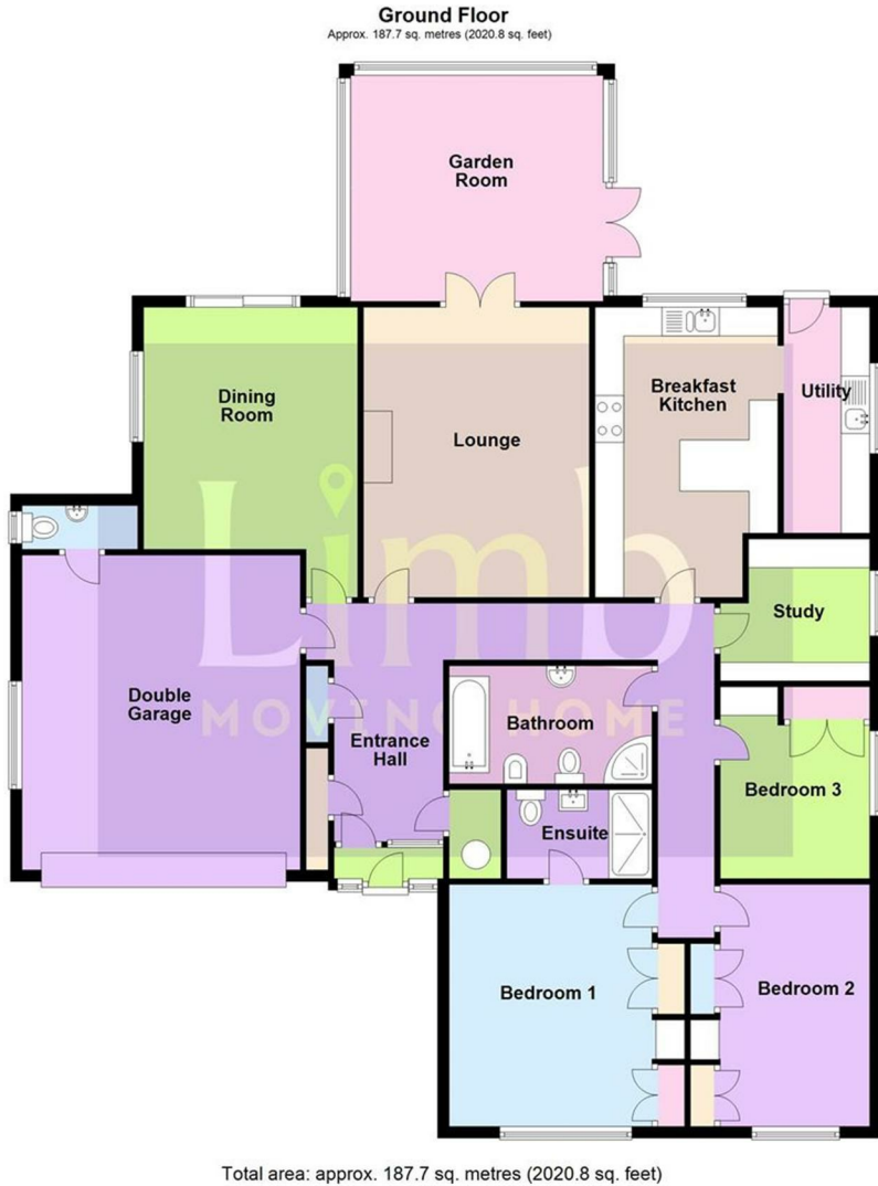
Total area: approx. 187.7 sq. metres (2020.8 sq. feet)